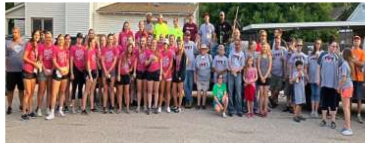
Delano Cleanup Volunteers 2018.

Thank you to our neighbors who participated in our annual cleanup. The night before, we worked together to get unwanted large items out to the curbs. On Saturday morning, many volunteers helped load four packer trucks and pick up trash for twelve roll-off dumpsters near overgrown alleys. We joined Love Your Community in the afternoon for lunch, a food drive and many more activities. Now, the task falls on each of us to keep our neighborhood looking great year round. Keep in mind homeowners adjacent to an alley are responsible for cutting weeds and grass from their property line to the middle of the alley.